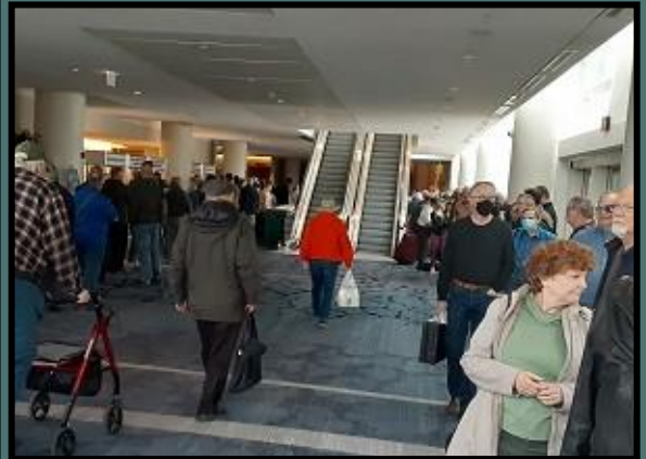
Long Registration lines on Thursday