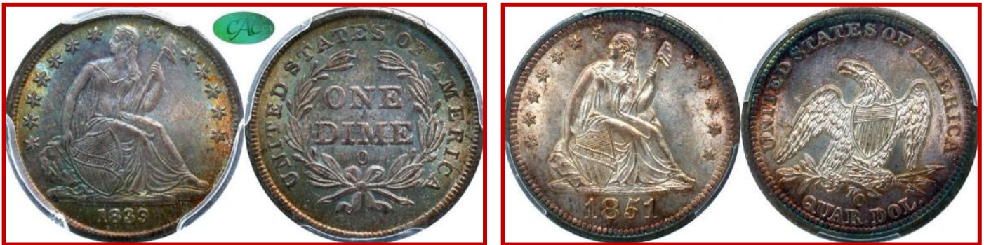
A few enlarged images from pages 4-5 of the GFRC Branch Mint Collection's Type Set Sale

Use this link for more information about the upcoming ANA Summer Convention https://www.money.org/worldsfairofmoney