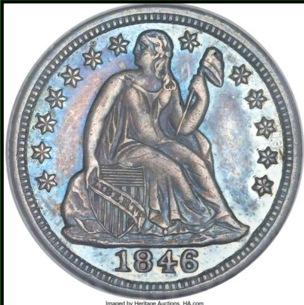
1846 PCGS-63 CAC Sold for $86,250 in 2009