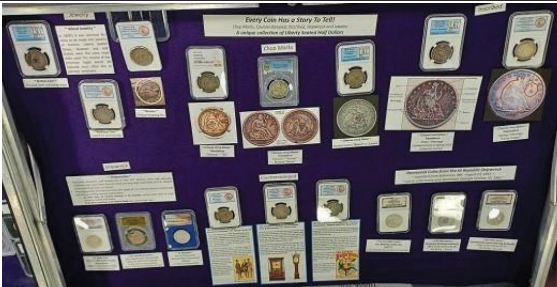
Table Displays in Baltimore