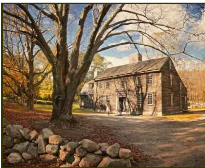
19th Century Tavern