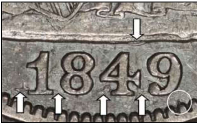
1849 WB-6 Dramatically Doubled Date 50¢

Date photos of these two major varieties are depicted below and detailed information is included in my books. Thanks! Bill Bugert