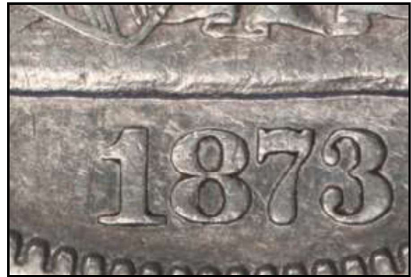
1873 No Arrows Open 3 50¢

Gobrecht Family In America - - - Coat of Arms