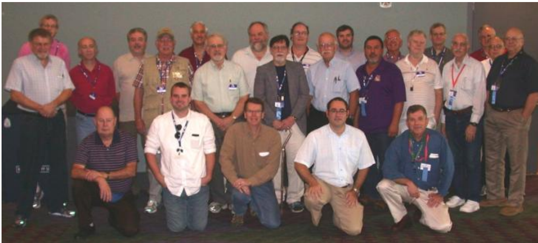
Attendees at the January 2013 FUN LSCC Regional Meeting (at least, those who were on time and wanted their photo taken)