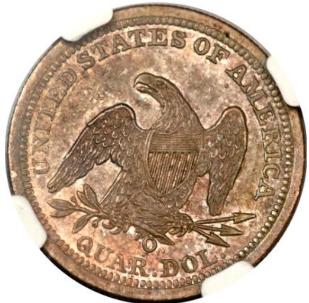
(Figure 1. The Eliasberg 1843-O Large O 25¢)

Though the majority of 1843-O Large O quarters grade Fine or less, there are several AU examples in addition to the single MS specimen. The four finest known examples are a PCGS AU53, NGC AU55, NGC AU58 and the mint state Eliasberg coin. All four of these examples have been auctioned by Heritage since early 2003, with two of them sold just this month. Auction appearances are summarized in the following list, along with two recent auction appearances of XF examples: