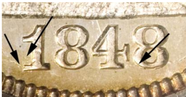
Figure 3. 1848 1/4 dollar tripled date

Quarter of the Month (Continued from page 6)