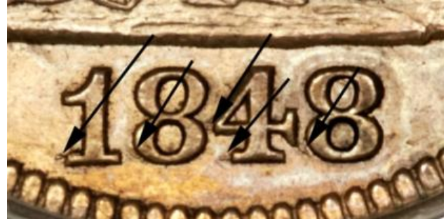
Figure 1. 1848 1/4 dollar doubled date

Another interesting feature of the 1848 quarter is that it comes with two, and only two, die pairings – both featuring repunched dates. Briggs 1-A pairs an obverse with a double punched date (Figure 1) with a