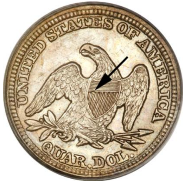
Figure 2. 1848 compass point reverse

reverse having the so-called “compass point” defect in the eagle’s shield (Figure 2). Briggs 2-B pairs an ob-