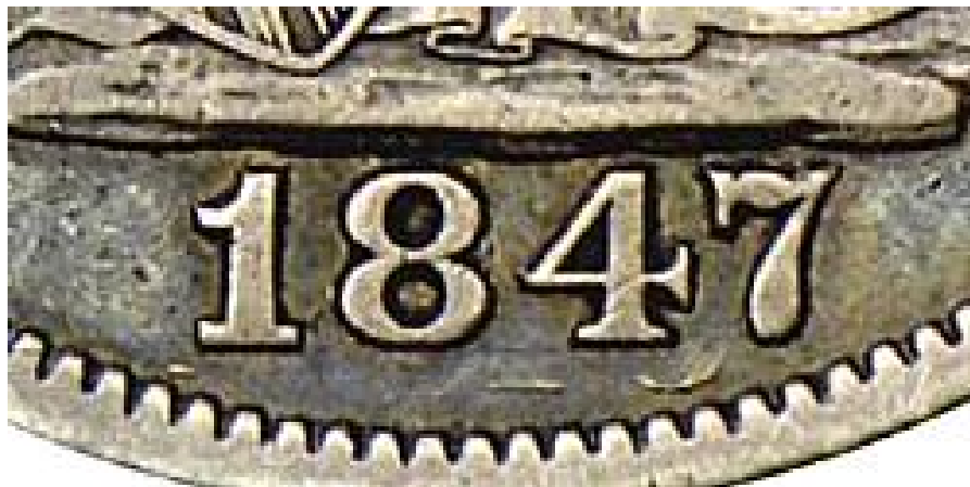
1847/1846 Half Dollar date close up - early die state

In my opinion, I would not recommend paying a significant premium for a variety coin when the characteristic that defines that variety cannot be seen. But of course, that's just my opinion.