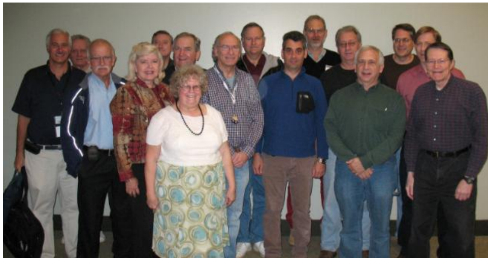
Attendees (at least most of them) at the November 2010 Baltimore club meeting

At least twenty four members and guests attended the November regional meeting of the LSCC at the Baltimore Whitman Coin and Currency Convention.