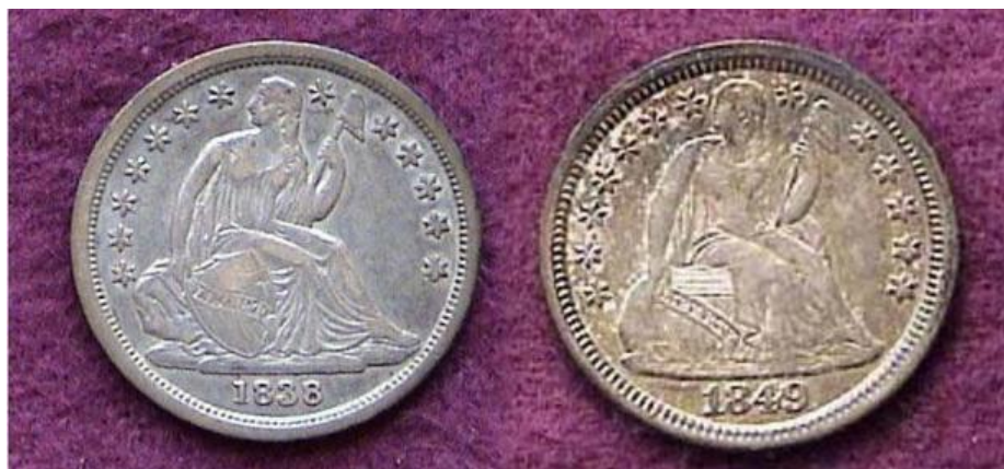
Obverses of an 1838 dime and 1849 dime compared.

In 1840 Robert Ball Hughes an engraver from England was brought into the Philadelphia Mint to help "improve" the original designs Gobrecht prepared. Many numismatists share the opinion that he actually weakened the design by enlarging the head while widening (or flattening out) the appearance of the seated figure. Other questionable changes involved reducing the size of the rock at the lower left while increasing the size of the scroll across the shield. Besides adding drapery to Miss Liberty's gown ( between her left elbow and waist ) on the half dimes and dimes of 1840, Hughes also rearranged the shield from a slanted to an upright position further weakening the design. Ironically it is these very questionable modifications that have created numerous obverse and reverse sub-types for the more ardent collectors of Liberty Seated coinage to consider.