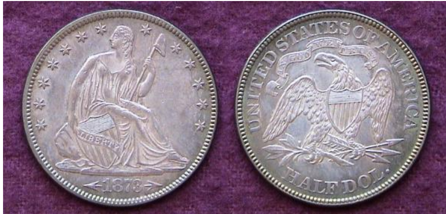
An 1873 Liberty Seated 50¢ with arrows grading AU-58

Of the six Liberty seated denominations, it is the half dollar that comes closest to realizing Gobrecht's original artistic conception as it appears to have been little altered except for the 13 stars being added to the obverse field.