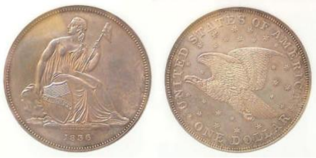
An 1836 Gobrecht Dollar J-60 Original