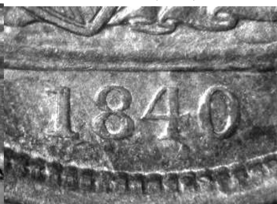
Medium Level Date - DR -3B-2

Next are comparison images of the reverse dies in early and late dies states. Reverse A design element weakness is most evident during F-101a die state.