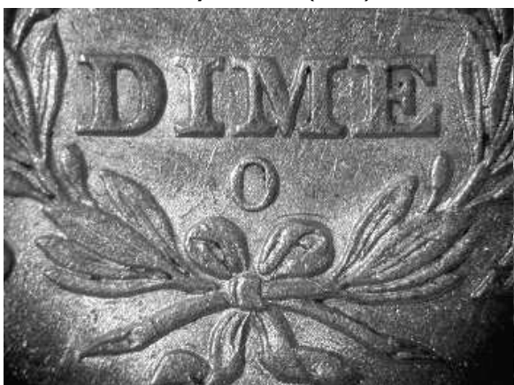
Early Die State (F-101)