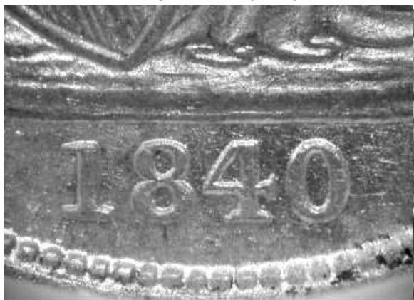
Medium Level Date - DR -3R