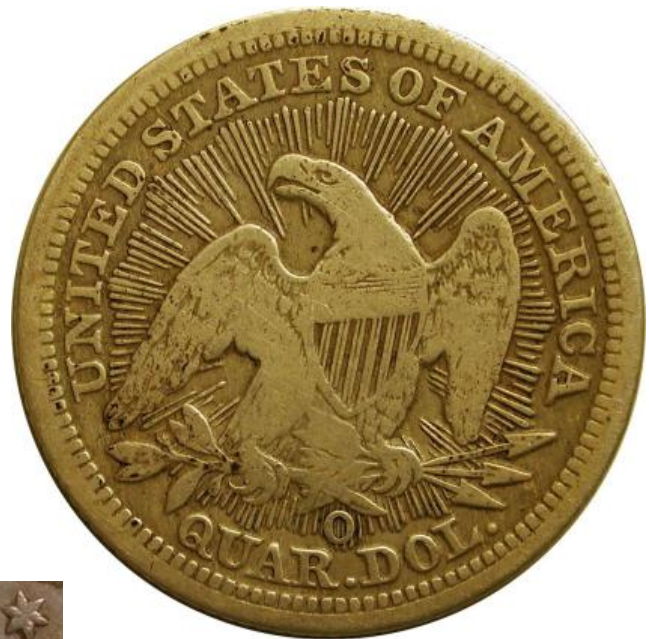
1853-O J-112 Reverse (above and at right). Mintmark close-up.