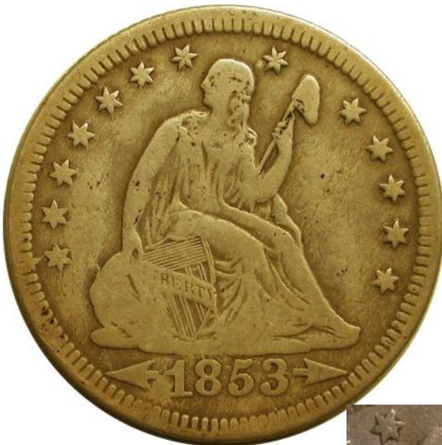
1853-O J-112 Obverse (above)

die marriage was Obverse 2 (identified by the die chip in image below) paired with Reverse D (identified by the mintmark location shown below; the die marriage was assigned the J-104 number in the Gobrecht Journal article. It was the only one of the 11 catalogued die marriages to include reverse D. The newly discovered die marriage pictured pairs reverse D with a different, possibly unknown, obverse die. The discovery coin grades Fine, too low a grade to conclusively rule out the possibility that it is a previously identified obverse. It is certain, however, that it is not Obverse 2 (the obvious die chip at Liberty's neck is absent) and that the die marriage has not been seen previously. I will catalogue the new die marriage as J-112. For those few, dedicated collectors working on a die marriage set of 1853-O quarters there is now a new, challenging die marriage for which to search. Happy hunting!