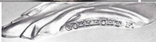
Medal details below