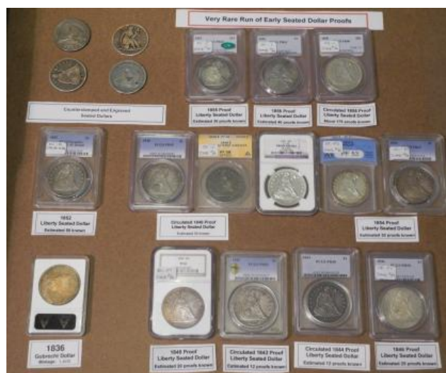
Club member staffing the table at the Houston, TX Show (above left) Liberty Seated Dollar portion of the club table display (above right)