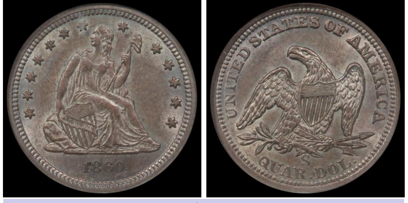
Figure 1. 1860-S Quarter PCGS MS61/CAC

Population Data (7/14): After 28 years and multiple millions of coins certified by both of the major grading services, this piece still remains the sole 1860-S quarter in Mint State. In all grades only 80 certification events have occurred, again combining both of the major services' data.