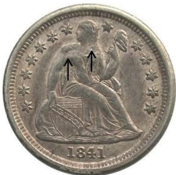
Figure 7: F-109a Filled Die Obverse

per left obverse, occurred during the coinage process. The next logical step for developing an explanation is examining other striking anomalies seen on dimes struck that year and during 1842 since research suggests that some 1841 dated dimes were struck after 1842 dated coinage. We are aware of several filled die issues including the F-109a filled obverse die at Liberty's head and from an F-106 piece currently listed within my inventory. Please see Figures 7 and 8. Is the mystery divot on F-111 specimens caused by a filled die event? I tend to doubt this explanation.