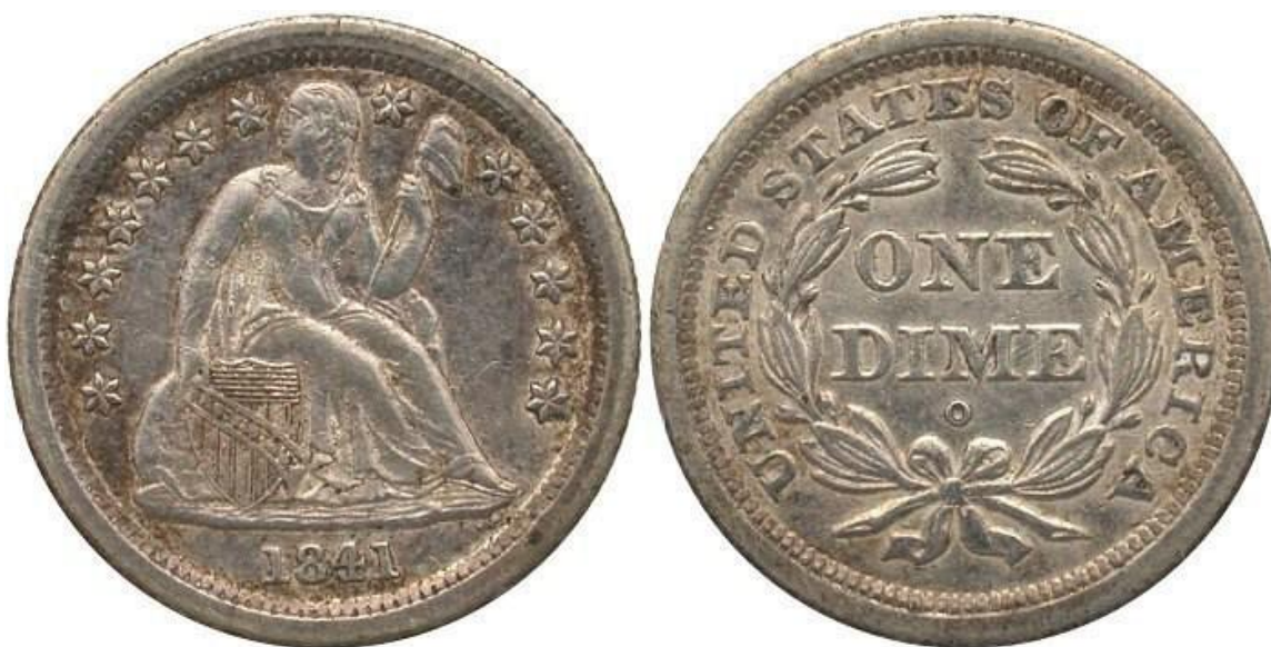
Figure 1: 1841-O F-111 with Rusted Obverse Die

As listed in The Definite Resource for Liberty Seated Dime Varieties Collector at www.seateddimevarieties.com , the 1841-O F-111 die variety results from the die pairing of Obverse 8 and Reverse K. Obverse 8 is easily diagnosed from moderate rusted die pitting throughout Liberty's gown lines and within the shield coupled with a low upward sloping date punch. Reverse K is in better condition with only a few die defects surrounding ICA in AMERICA along with a small O mintmark that is nearly centered about the two ribbon loops. This die pairing is not common and considered to be R4 in VF or better grades.