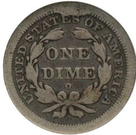
Figure 3: F-111b Reverse Cud

high grade F-111a example for the web-book. However, the divot bothered me as it did not appear to be the result of a post mint damage event but rather a potential filled die issue. Additional confirmation pieces would be necessary to validate my assumption and those were located after carefully searching on eBay.