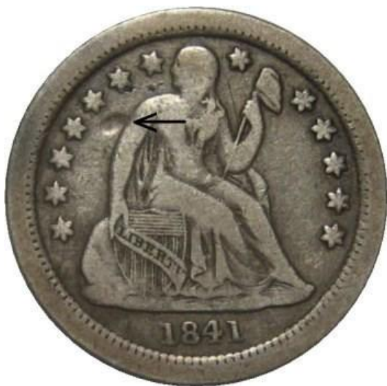
Figure 5: F-111 eBay Listing with Divot