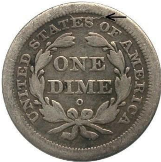
Figure 2: F-111a Cracked Reverse