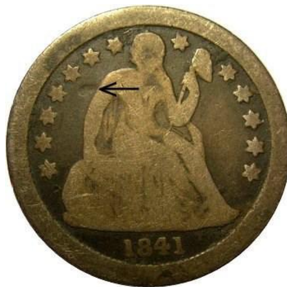
Figure 6: F-111 eBay Listing with Divot

per left obverse, occurred during the coinage process. The next logical step for developing an explanation is examining other striking anomalies seen on dimes struck that year and during 1842 since research suggests that some 1841 dated dimes were struck after 1842 dated coinage. We are aware of several filled die issues including the F-109a filled obverse die at Liberty's head and from an F-106 piece currently listed within my inventory. Please see Figures 7 and 8. Is the mystery divot on F-111 specimens caused by a filled die event? I tend to doubt this explanation.