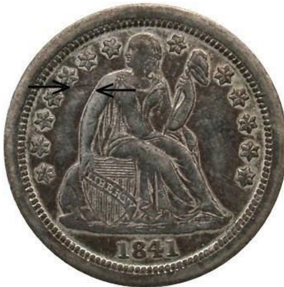
Figure 4: 1841-O F-111a with Obverse Divot

high grade F-111a example for the web-book. However, the divot bothered me as it did not appear to be the result of a post mint damage event but rather a potential filled die issue. Additional confirmation pieces would be necessary to validate my assumption and those were located after carefully searching on eBay.