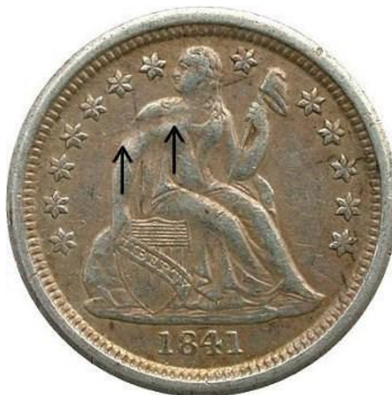
Figure 8: F-106 Filled Die Obverse

If not caused by a filled die, then what other obverse depression are known for 1841 and 1842 New