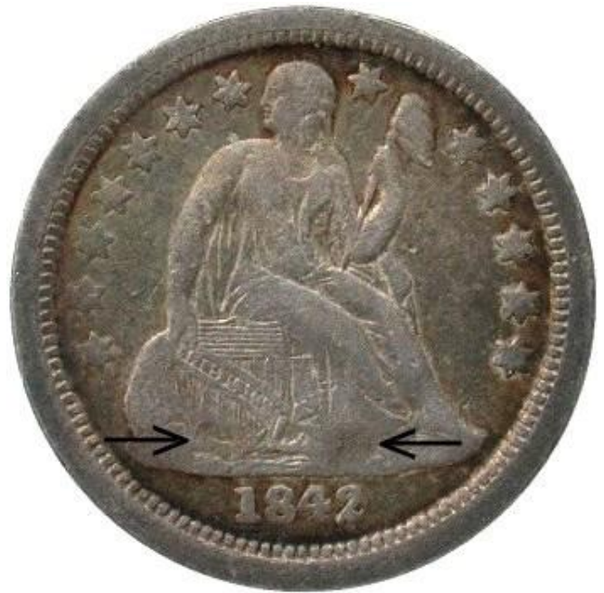
Figure 9: 1842-O F-101b with Depression