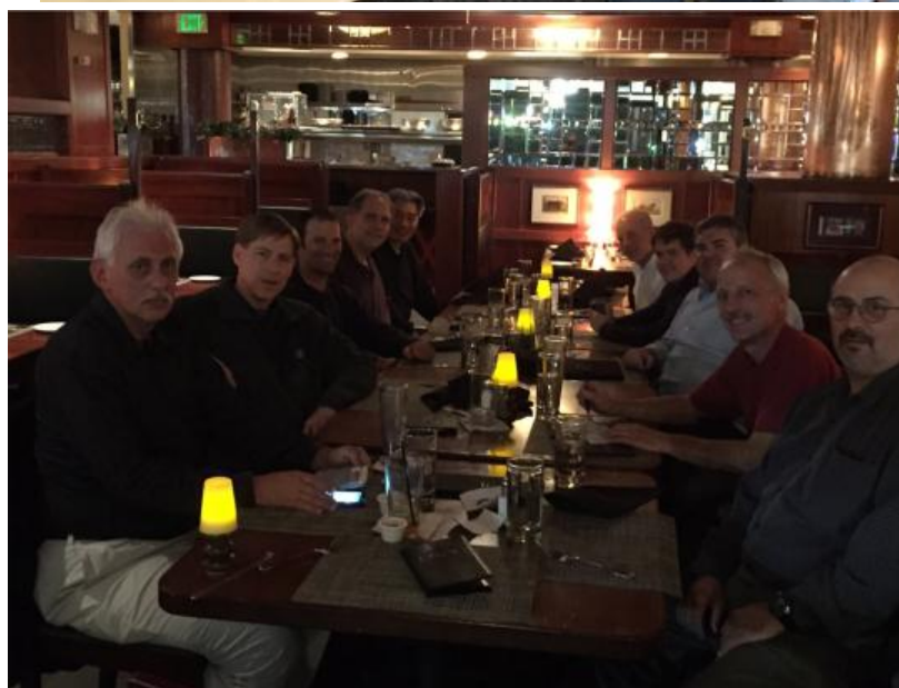
Some of the meeting attendees (above) and a group dinner (at right)