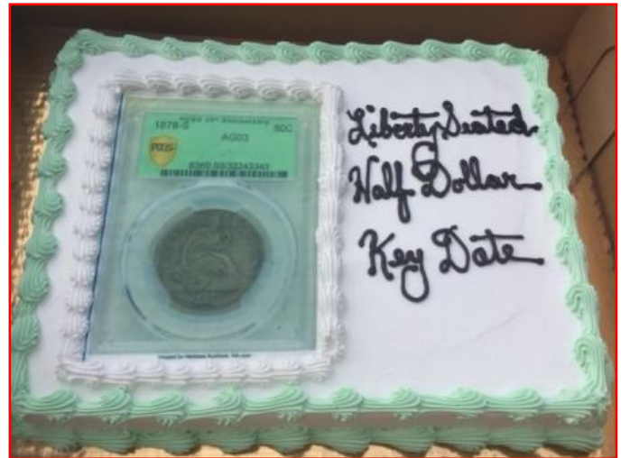
1878-S Half Dollar on the "Key Date Cake."