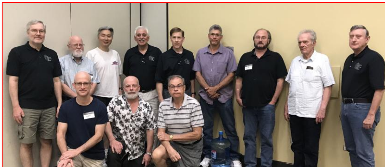
Group photo (at least those there for the camera) at the June 2018 LSCC meeting at the Whitman Baltimore Expo.

The E-Gobrecht is an award winning informal electronic publication of the Liberty Seated Collectors Club (LSCC). The LSCC is a non-profit organization dedicated to the attributions of the Liberty Seated Coin series. The LSCC provides the information contained in this email newsletter from various sources free of charge as a general service to the membership and others with this numismatic interest. You do not have to be a LSCC member to benefit from this newsletter; subscription to the E-Gobrecht is available to anyone. All disclaimers are in effect as the completeness and/or accuracy of the information contained herein cannot be completely verified. Contact information is included on the last page.