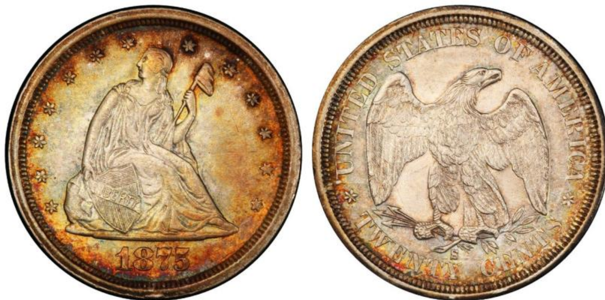
1875-S Double Dime, BF-5

The twenty-cent denomination of the Liberty Seated series offers some very interesting die state varieties. Probably none better than the year 1875 from the San Francisco branch mint with a mintage of 1,155,000 pieces and 16 die marriages so far identified.