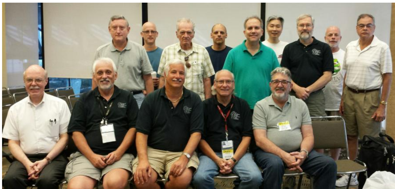
July 2016 Whitman Baltimore Summer Expo LSCC regional meeting attendees.

Hunts Merchant Magazine, Volume 2, 1840, page 514 for copy of the 1839 Annual Report of Director of the Mint