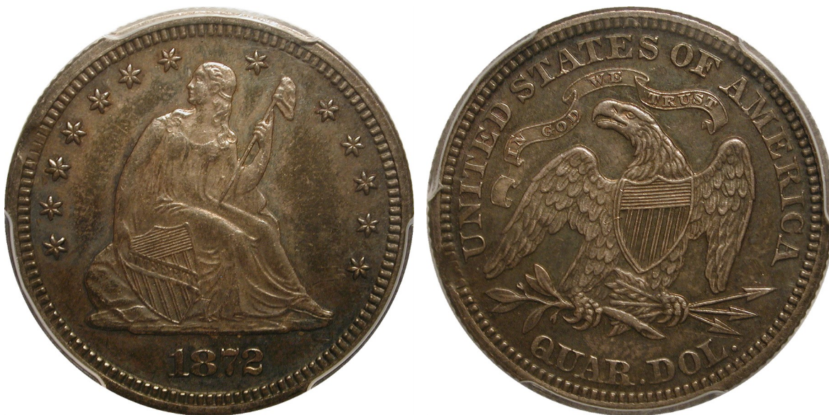
1872 Liberty Seated Quarter, Struck on a Clipped Planchet

This most unusual coin will be at the LSCC-BCCS table at the ANA in Anaheim this year, and again in Baltimore in November (and any other shows I do in the near future). Come by and see it!