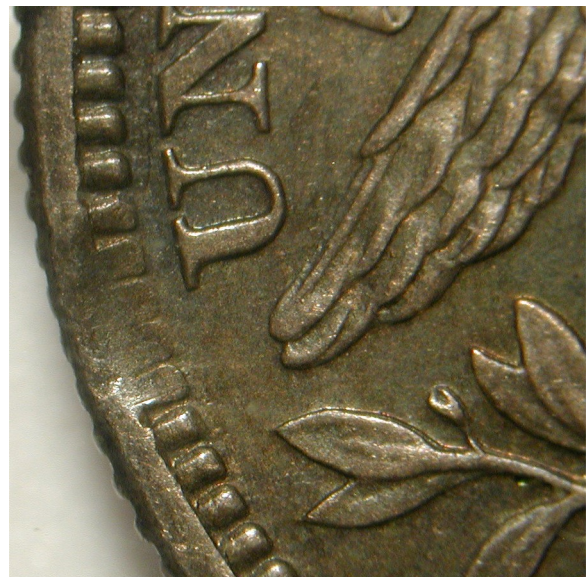
Close-ups of clip, including the weakened edge reeding.