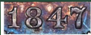
Imaged by Heritage Auctions, HA.com

Dramatic image of the recent solar eclipse courtesy of a local resident and an 1847 Liberty Seated Quarter with reverse double die and repunched date PCGS MS 64 CAC (Briggs-2A) (Rarer of the two obverse dies for this DDR later reported by Greg Johnson) (Coin images courtesy of HA.com) See page 8.