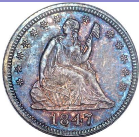
Imaged by Heritage Auctions, HA.com

Dramatic image of the recent solar eclipse courtesy of a local resident and an 1847 Liberty Seated Quarter with reverse double die and repunched date PCGS MS 64 CAC (Briggs-2A) (Rarer of the two obverse dies for this DDR later reported by Greg Johnson) (Coin images courtesy of HA.com) See page 8.