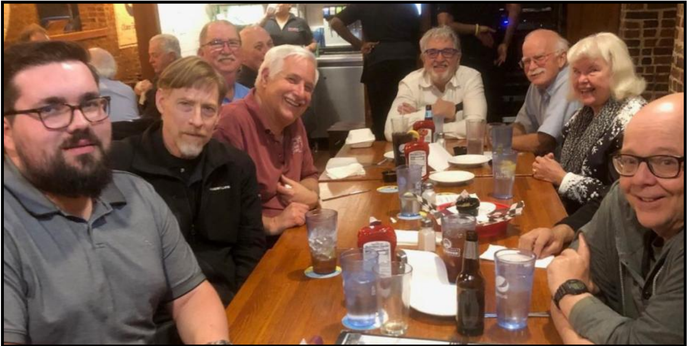
The Club Dinner at Pratt Street Ale House in Baltimore (We all know some of these folks... Who is that couple from Texas? Many different states certainly represented here.)