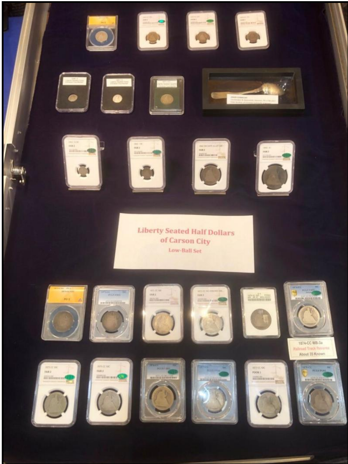
Low-ball Carson City Half Dollars & Liberty Seated Coinage