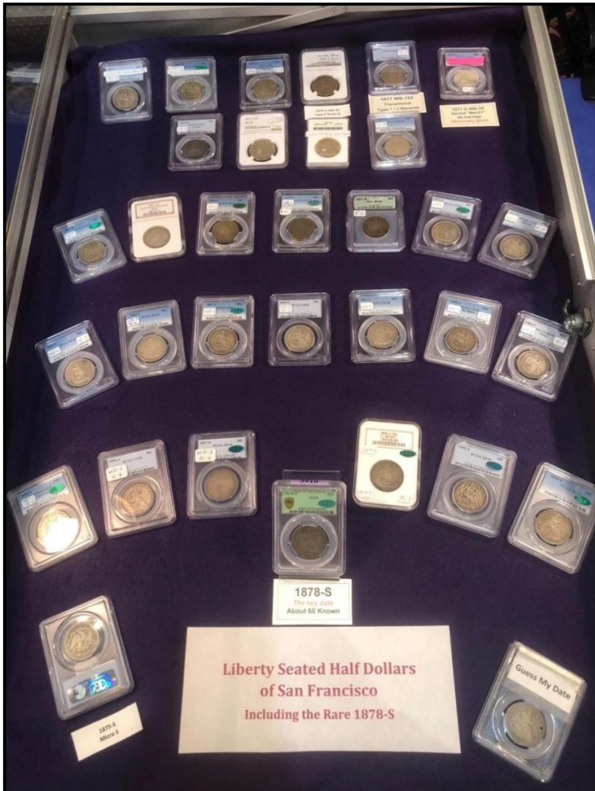
Liberty Seated San Francisco Half Dollars