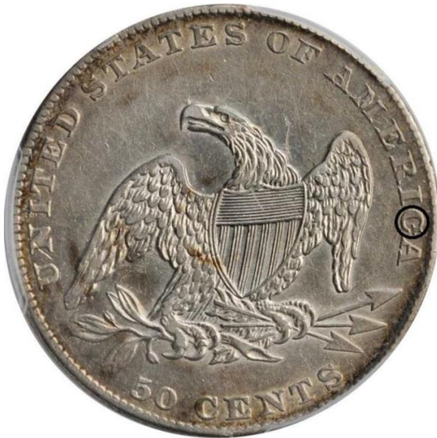
1837 GR-7 Reverse

On December 15, 2022, Newsletter #44 will provide New Rarity Ratings for the “Gobrecht Bust Half Dollar” series from 1836 to 1839. Also provided in Newsletter #44 will be photos and information on the very important 1837 GR-7 Die Marriage (28th place). 1837 GR-7 besides being a named variety “Inverted G, instead of C” comes with a reverse that is rotated as much as 45 degrees. Every serious LSCC member should be able to eventually find this variety unattributed (see below):