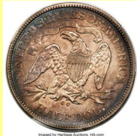
1870-CC PCGS-50 Liberty Seated Half Dollar