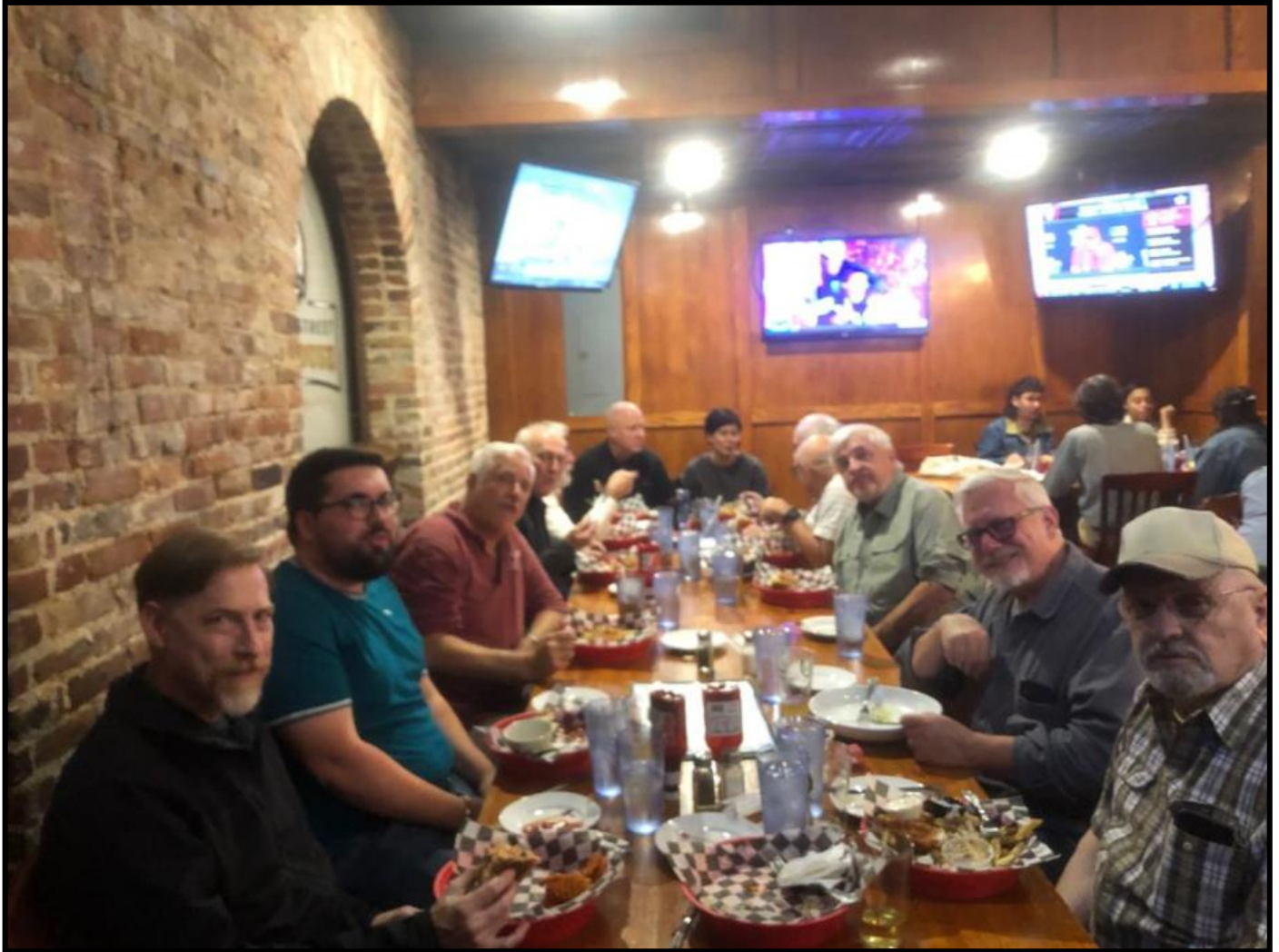
Club Dinner in Baltimore (a nice crowd)

Both “E-Gobrecht & Gobrecht Journal” display advertising rates & E-Gobrecht classified ad rates available upon request