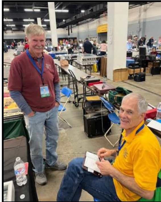
Greenville, SC Coin Show & LSCC Table