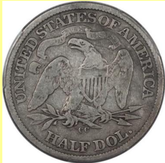
The 1871-CC Liberty Seated Half Dollar - An underrated issue

The Chopmarked Liberty Seated coin survey conducted over the spring and summer of this year has ended and the results will be in the Fall issue of the Gobrecht Journal. Some interesting data was gleaned from the information so graciously given by the LSCC members. A brief look at the chopmarked half dollar results will be in the February issue of this newsletter.