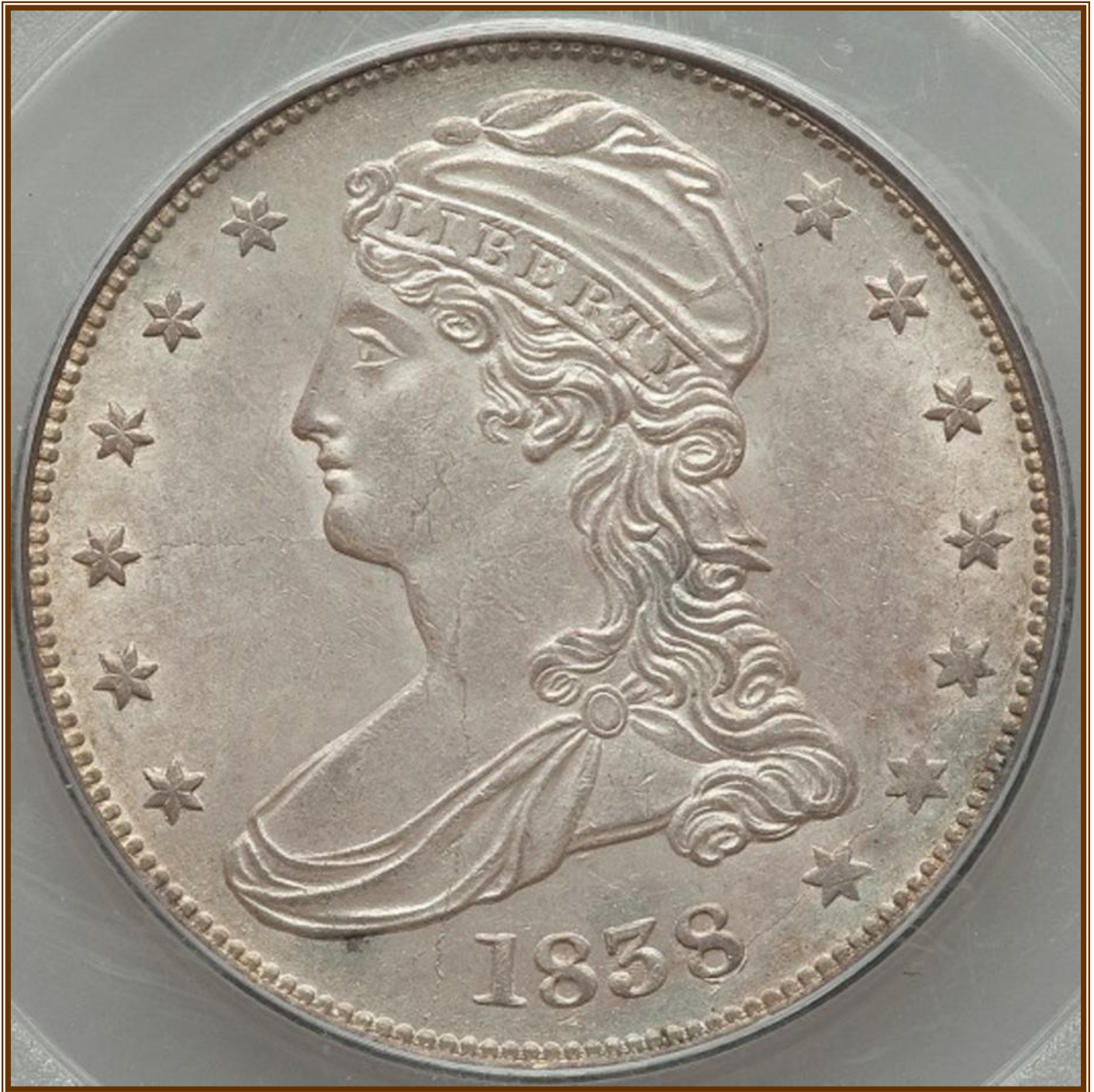
1838 GR-16 PCGS MS62 Obverse

Since August 2019, I have been writing monthly Newsletters on the “38 Most Common Die Marriages of Reeded Edge Halves”. My Newsletters contain large photos and interesting information on “Gobrecht” Bust Half Dollars. The next Newsletter #35, will contain information on the 1838 GR-13 die marriage. If you would like to receive this information, simply send your name and email address to: bustcoin1@verizon.net