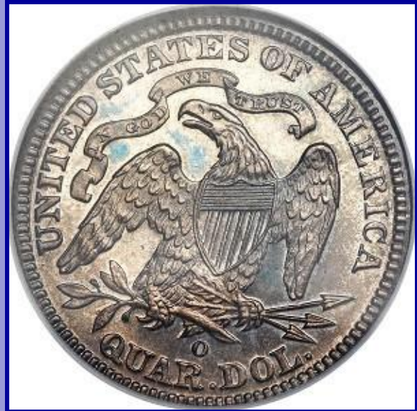
1891-O Liberty Seated Quarter - PCGS MS64