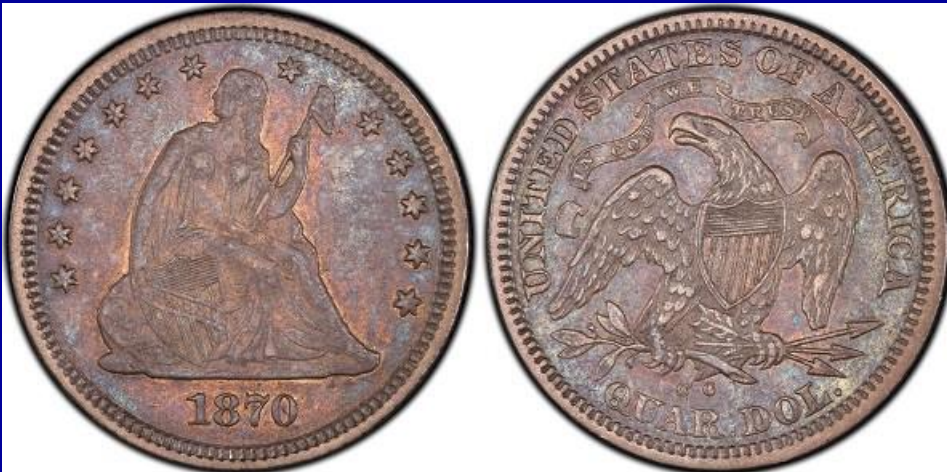
1870-CC Liberty Seated Quarter PCGS AU55/CAC

Ex: Richmond Collection, Battle Born Collection, & Gene Gardner Collection