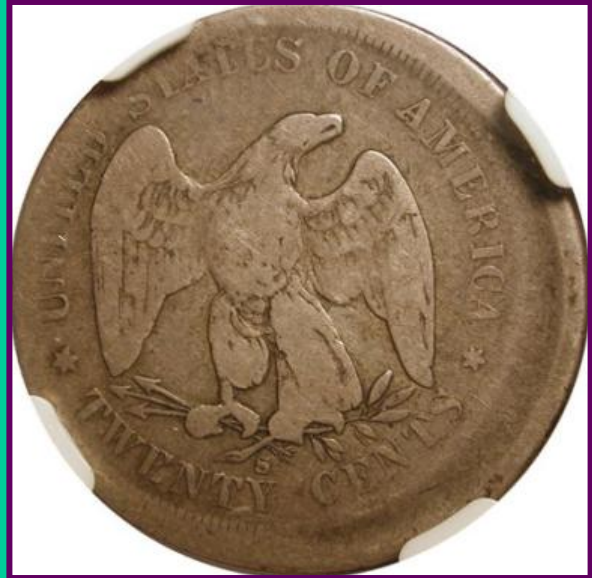
1875-S Liberty Seated Double Dime NGC VG10 - 10% Off-Center

Despite being low grade and a little deceptive due to the upset rim of the planchet before striking, clearly the denticles on both sides are off the planchet on both sides and the tops of the letters on the reverse barely stay on the coin. I wonder how long this coin was in someone's pocket? If the sun had been 90% eclipsed on the morning of June 10th, it would have been a dead ringer for this coin!