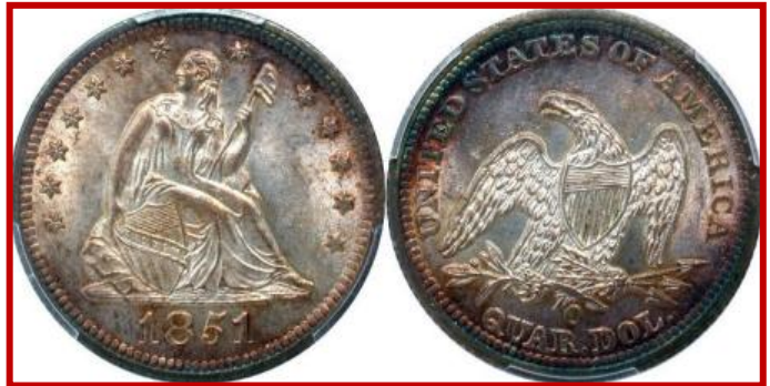
A few enlarged images from pages 4-5 of the GFRC Branch Mint Collection's Type Set Sale

Use this link for more information about the upcoming ANA Summer Convention