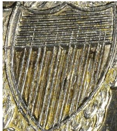
1844 Late Die State Briggs 1-A Liberty Seated Quarter Dollar Left—Figure 1 (Reverse), Right—Figure 2 (Reverse shield lines)

Some of the most interesting and most underrated Liberty Seated quarters were produced in the 1840s. Even the highest mintage and most common of these early issues are quite scarce in Almost Uncirculated and Mint State grades; as well as in problem free XF/AU. Many also have interesting features resulting from the dies being hand made and then frequently run to destruction. This month's quarter is an 1844, Briggs 1-A in a late die state, but with a very strong "hammered" strike.