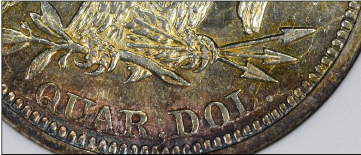
Figure 3 (above)—Heavy die cracks on LDS 1844 Briggs 1-A.

Look closely at those early dates. Even if they appear to be common issues in common condition. There are some really neat coins hiding among the “stuff.”