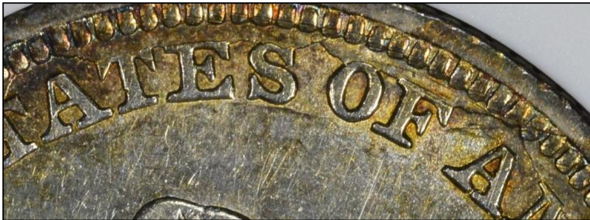
Figure 4 (above)—Retained cud above “TATES OF” on LDS 1844 Briggs 1-A.