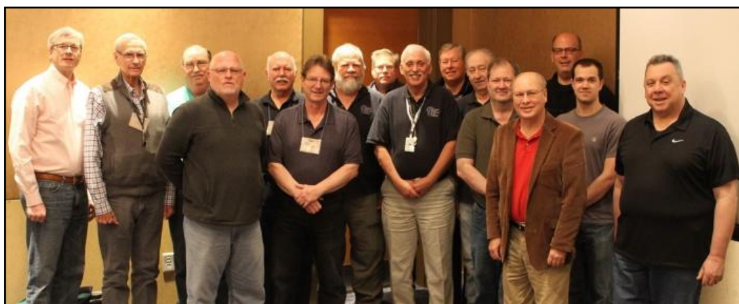
Group photo from the April 2019 LSCC Regional Meeting at the CSNS Show.