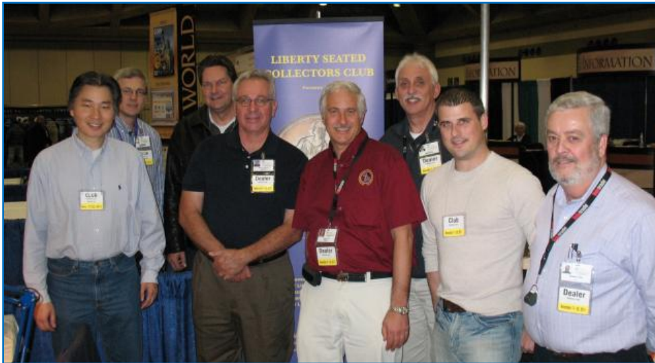
Exhibitors at SeatedFest I