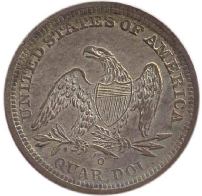
1843-O Small O, Reverse E Quarter Dollar.

The 1843-O quarter, as a date and mintmark, is a very scarce coin in high grade or problem free condition. In addition to the usual problems such as harsh cleanings and holes with which early Liberty Seated coins are