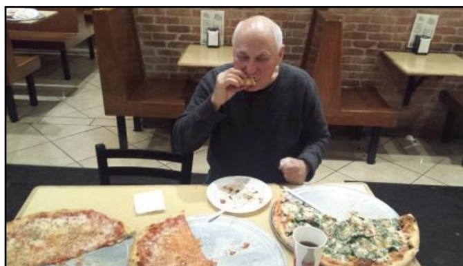
Working the tables makes me hungry!