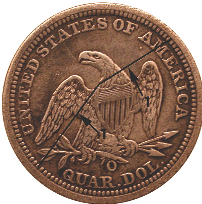
Figure 3. 1844-O with Reverse of 1843-O Large O quarter dollar with medal (rotated) alignment and with the first die crack highlighted and labeled.

The obverse of the 1844-O die pairing has very prominent die scratches between the dentils and stars 12 and 13 (Figure 1). The reverse is notable for the heavy raised die rust lumps (Figure 2), the mintmark embedded in the crotch, and heavy cracks in the later die states. There is a fairly clear progression of the die cracks that becomes apparent when studying multiple examples with and without rotation. Early die states are not rotated and may not have cracks. Figure 3 shows the reverse die when paired with the 1844-O obverse with medal (rotated) alignment; with the first die crack highlighted and labeled. This crack is seen on some examples of the 1844-O with coin alignment (i.e. prior to medal alignment coins being struck). Figure 4 shows the same coin as Figure 3 with both die cracks highlighted. All known specimens with medal alignment have both die cracks.