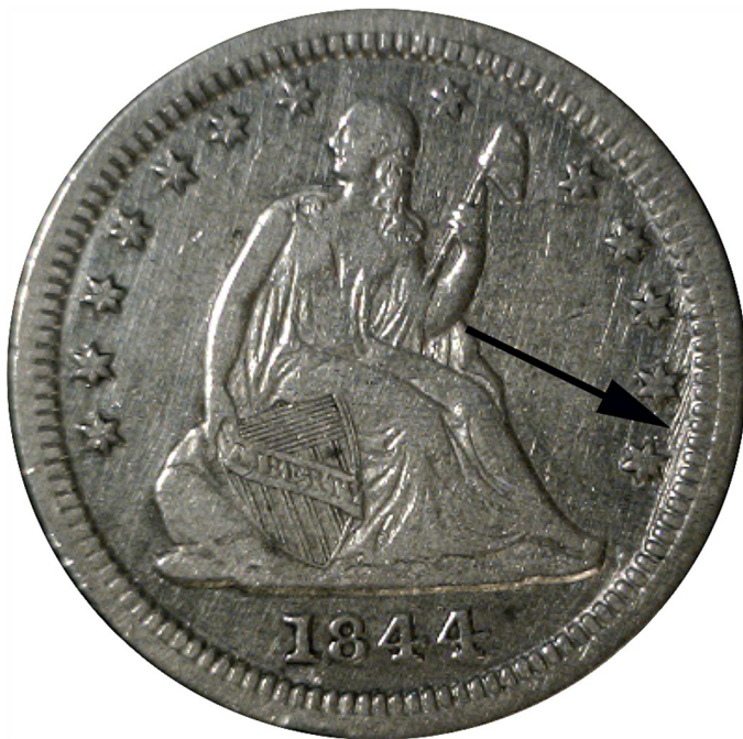
Figure 1. 1844-O with Reverse of 1843-O Large O quarter dollar with prominent obverse die scratches.