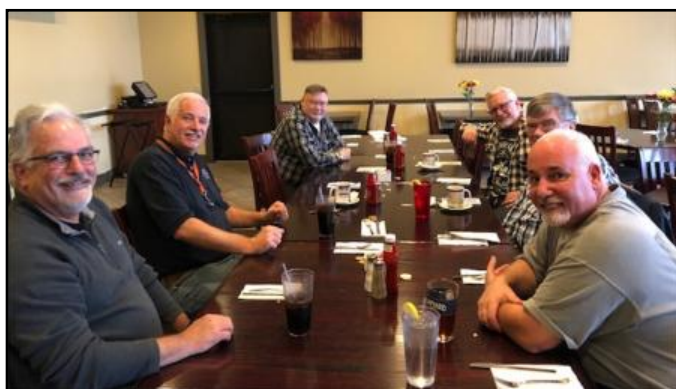
SeatedFeast, November 2018