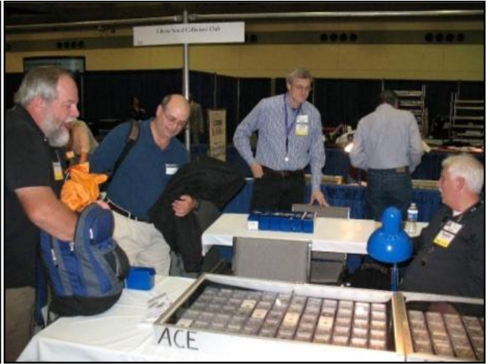
Coins and camaraderie at SeatedFest 2011 in Baltimore