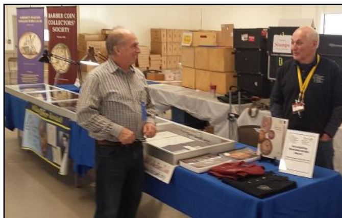
New Hampshire Coin Expo Barber Exhibit, November 2018