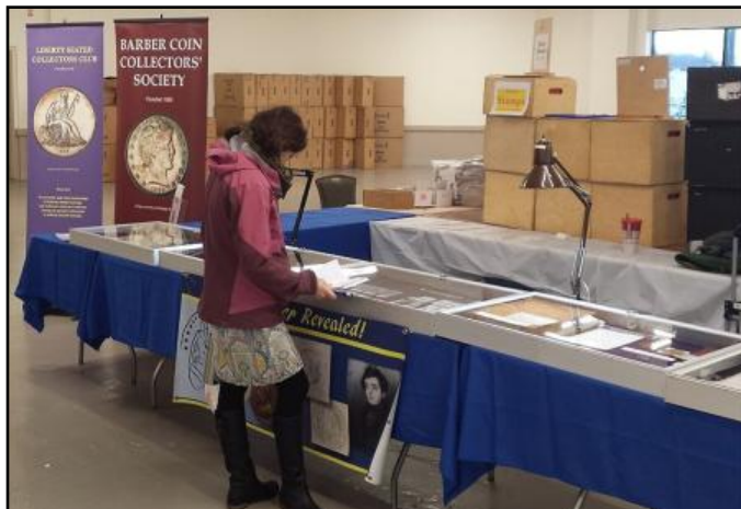
New Hampshire Coin Expo Barber Exhibit, November 2018