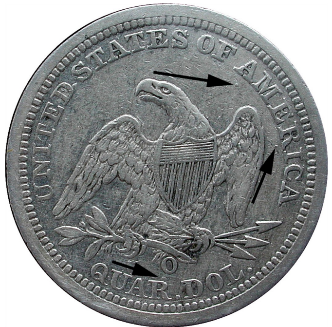
Figure 2. 1844-O with Reverse of 1843-O Large O quarter dollar with prominent raised die rust lumps.