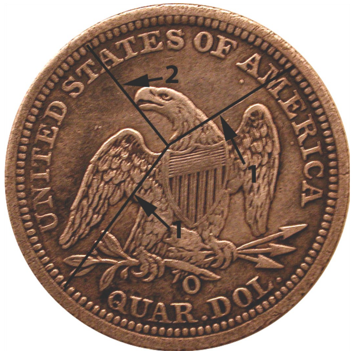
Figure 4. 1844-O with Reverse of 1843-O Large O quarter dollar with medal (rotated) alignment and with both die cracks highlighted.