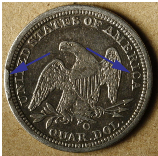
Figure 1. 1844-O Briggs 2-C reverse with cud.

Fast forward three years and Brian Greer has again found an interesting 1844-O quarter and it is again die marriage 2-C. This one has the first obverse cud that I have seen on an 1844-O quarter. The coin, obverse pictured in Figure 2, has a rim cud at 3 o'clock (stars 11-12), a much better strike (both obverse and reverse), and higher grade details than the coin in Figure 1, but appears to be from the same obverse die. Assuming that rim cuds appear in later die states than coins from the same dies without cuds, there is an unanswered question about this pair of coins. How is it that the later die state reverse in Figure 1 got paired with an earlier die state than the obverse in Figure 2, AND the later die state obverse in Figure 2 got paired with an earlier die state than the reverse in Figure 1?