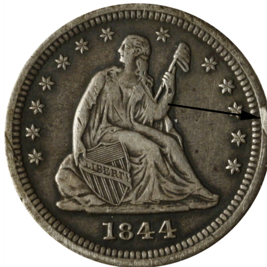
Figure 2. 1844-O Briggs 2-C obverse with cud.