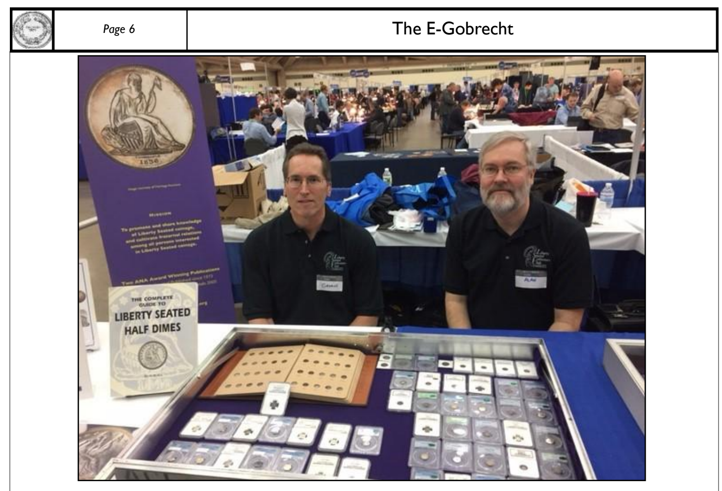
Liberty Seated half dime display and proud owner/exhibitors at the March 2017 Whitman Baltimore Spring Expo