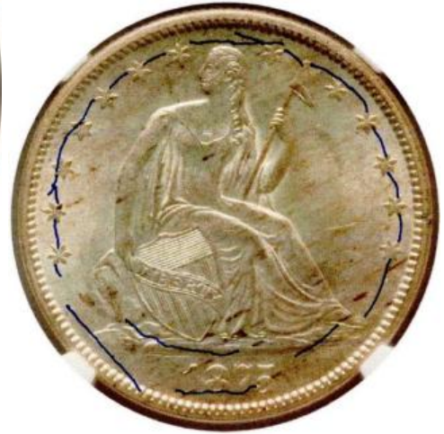
Obverse 2 (enhanced die crack diagram at right)