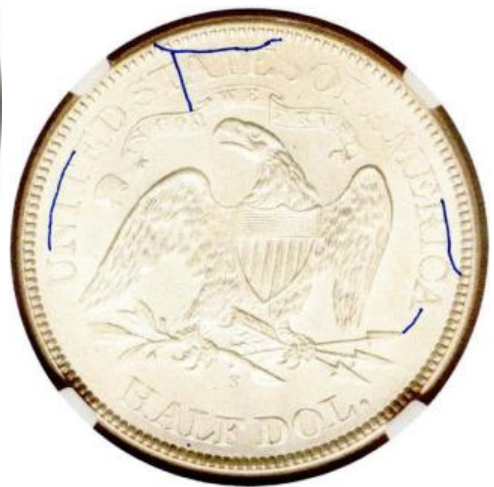
Reverse O (enhanced die crack diagram at right)