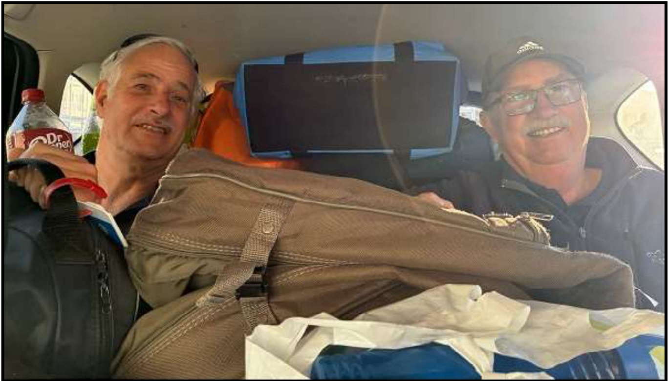
The only way to go to a coin show... packed to the hilt, stuffed in the back seat with a big bottle of "Dr. Per" Mr. Frosty & The Otto of course.