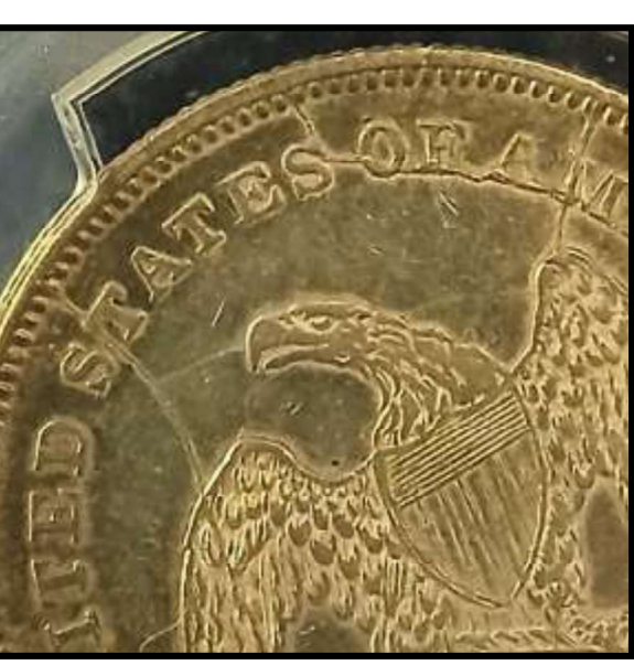
(Continued on next page)