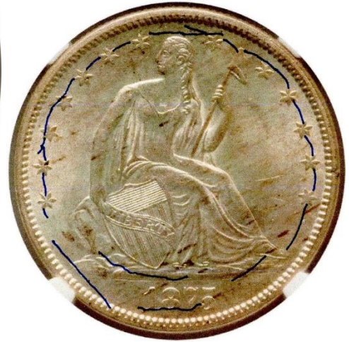
Obverse 2 (enhanced die crack diagram at right)