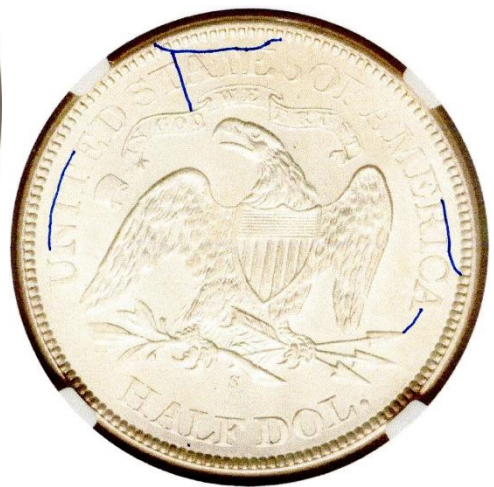
Reverse O (enhanced die crack diagram at right)