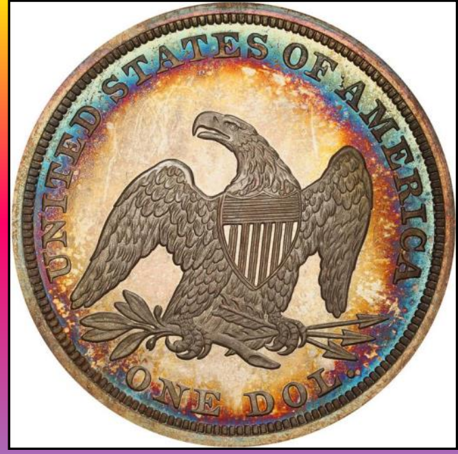
1865 Proof L.S. Dollar on page 12 and Club Meeting at Central States