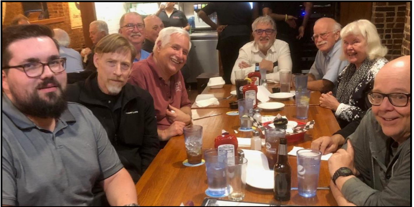
The Club Dinner at Pratt Street Ale House in Baltimore (We all know some of these folks... Who is that couple from Texas? Many different states certainly represented here.)